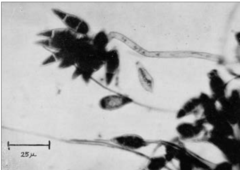
Figure 3. Conidia and conidiophore.