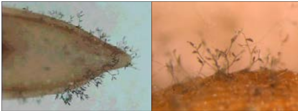
Figure 3. Conidiophores and conidia on rice seed.