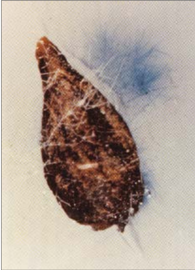
Figure 1. Indigo-coloured mycelium of C. fulgens growing from a Sitka spruce seed on water agar.