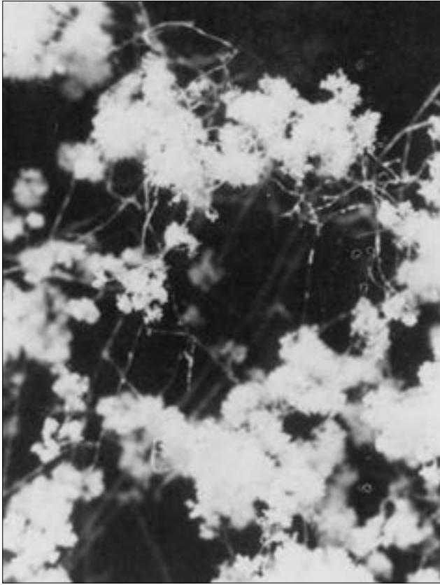
Figure 3. Conidia produced on Sitka spruce seed incubated on water agar.