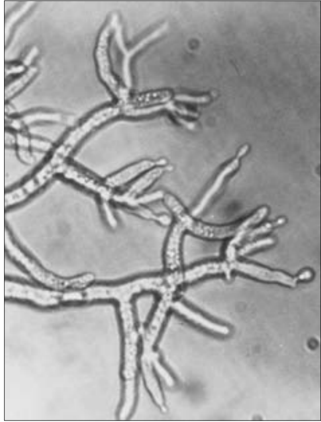
Figure 4. Conidiophores and conidia of C. fulgens .