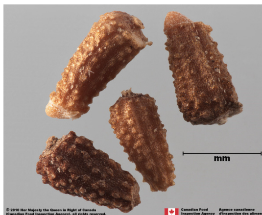
Anthemis cotula achenes

Embryo: Embryo with well-developed cotyledons and a broad stalk having a truncate top, no endosperm.