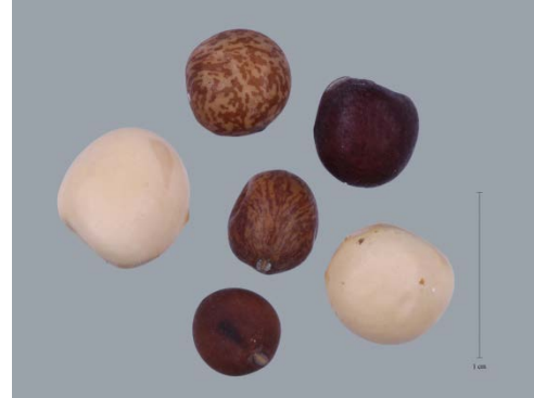
Seeds of Pisum sativum

Note: the seeds vary greatly depending on the variety regarding the size, shape and the texture of the seed and the color of the hilum.