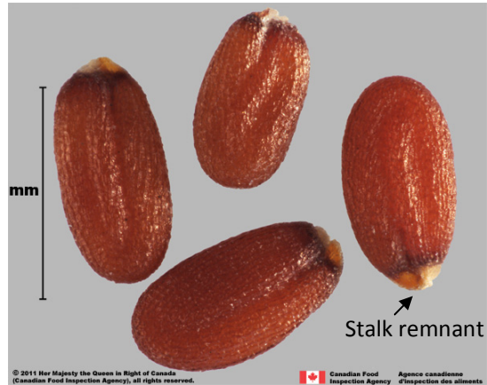
Capsella bursa-pastoris seeds

Embryo: Folded embryo with minimal endosperm present.