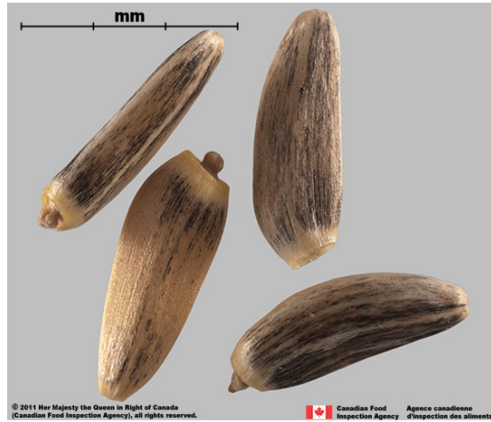
Cirsium vulgare achenes

Embryo: Embryo with well-developed cotyledons and a broad stalk having a truncate top, no endosperm.