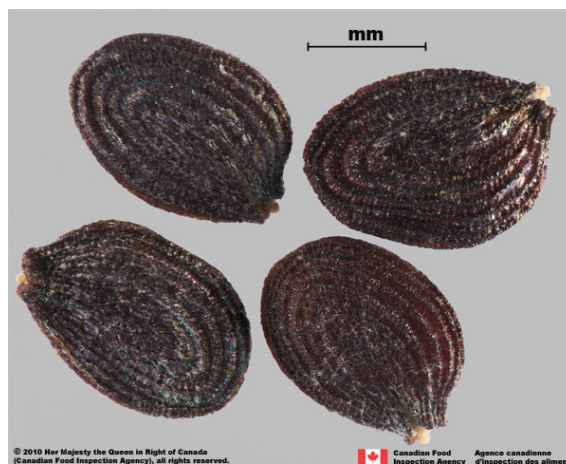
Thlaspi arvense seed

Embryo: Folded embryo with minimal endosperm present.