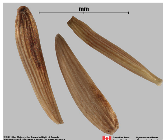
Lapsana communis achenes

Embryo: Embryo with well-developed cotyledons and a broad stalk having a truncate top, no endosperm.