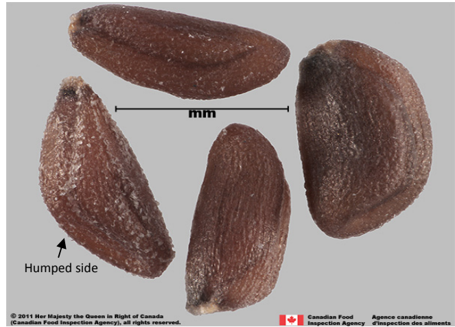
Sisymbrium officinale seeds

Embryo: Folded embryo with minimal endosperm present.