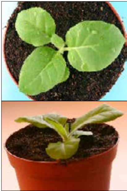
Plant 1. Too small.