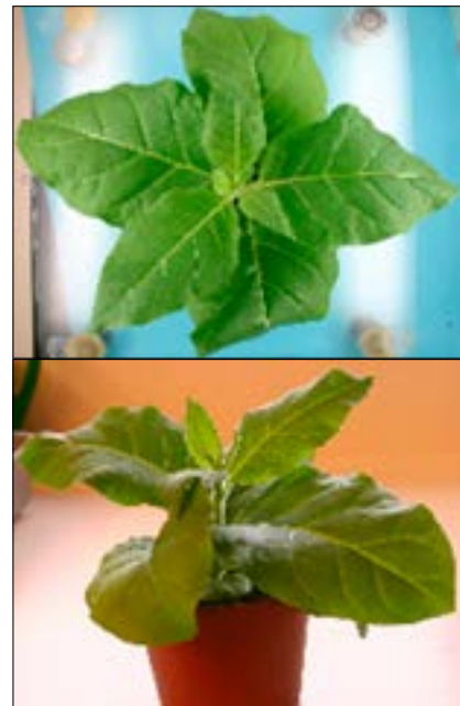
Plant 6. Plant too old and in regenerative phase.