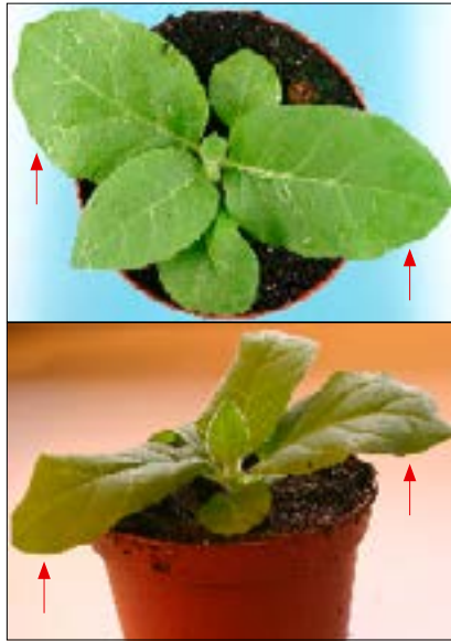
Plant 2. Usable but relatively small leaves.