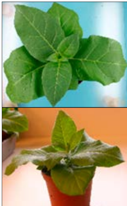
Plant 5. Plant too old.