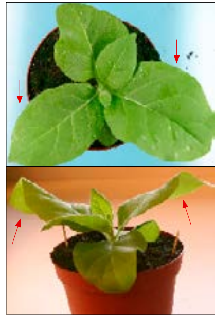
Plant 3. Usable plant.