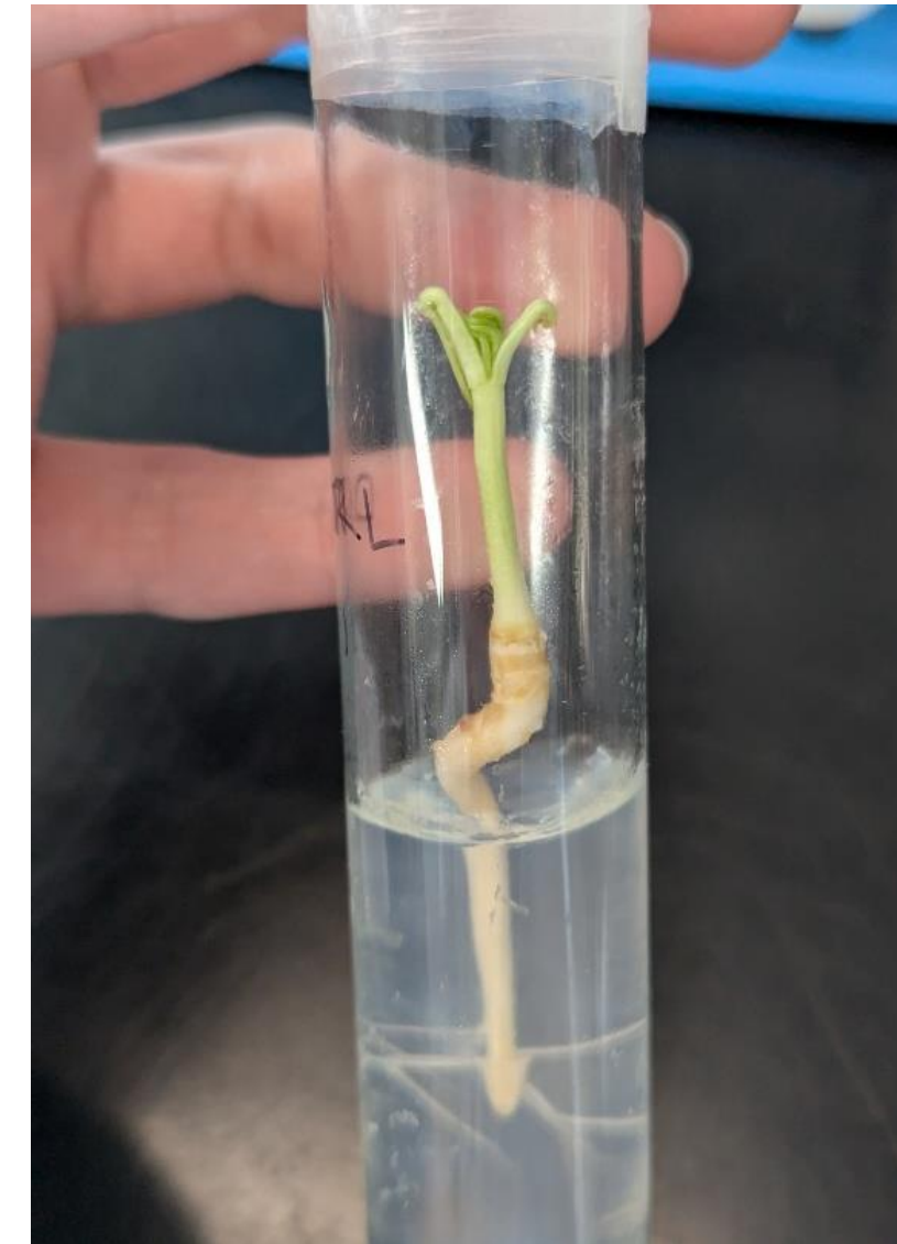
In vitro germination of Aesculus hippocastanum embryonic axis (part of MSc project: The impact of cryoprotection on the germination of Aesculus hippocastanum L. embryonic axes using two infiltration methods)