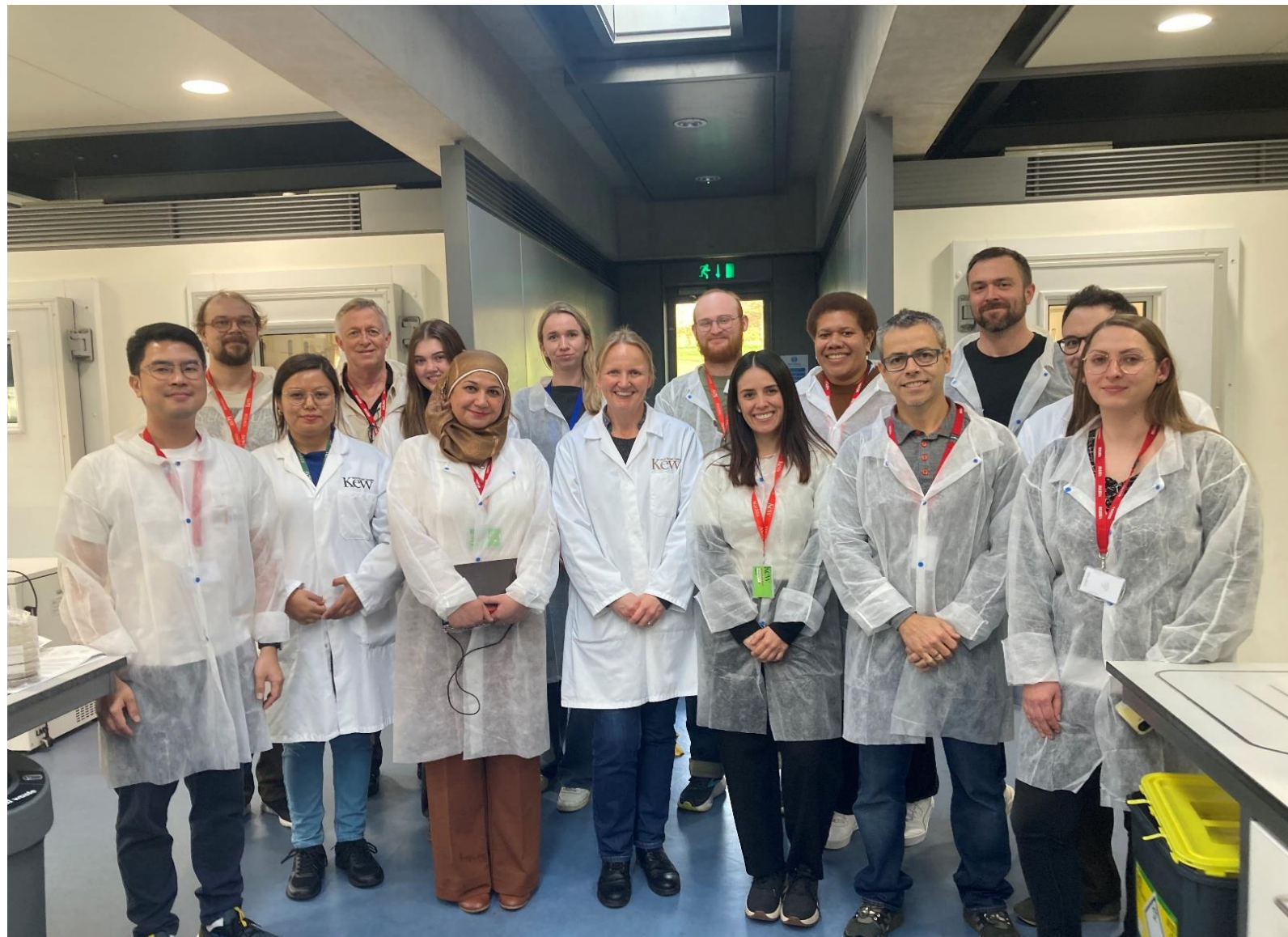
A training course on plant cryopreservation was delivered at Royal Botanic Gardens, Kew, UK, 4-12 Nov 2025, with 11 participants from 10 countries (Canada, Fiji, Finland, Germany, Mexico, Philippines, Poland, Spain, UK and USA) trained – Louise Colville