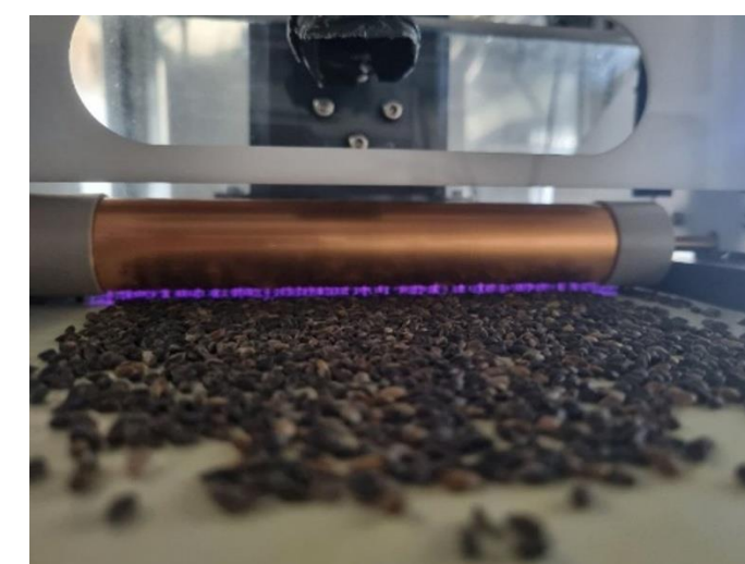
Seeds being treated with plasma at Leibniz Institute for Plasma Science and Technology

This article is Open Access under the terms of the Creative Commons CC BY-NC licence.