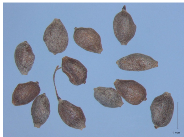
Seeds of Cyperus rivularis