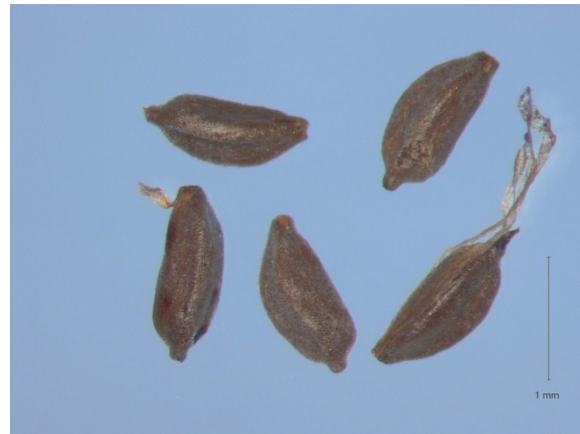
Seeds of Cyperus longus