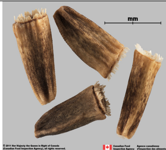
Cichorium intybus achenes with pappus

Embryo: Embryo with well-developed cotyledons and a broad stalk having a truncate top, no endosperm.