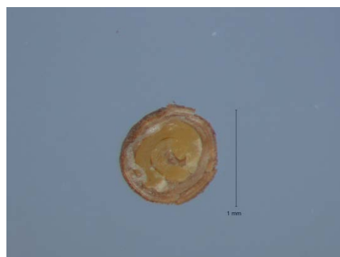
Cross section of seed showing embryo and nutritive tissue