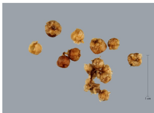
Fruits of Cuscuta spp.