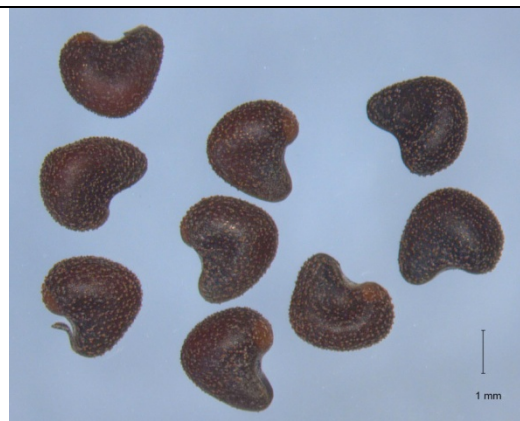
Seeds of Hibiscus trionum