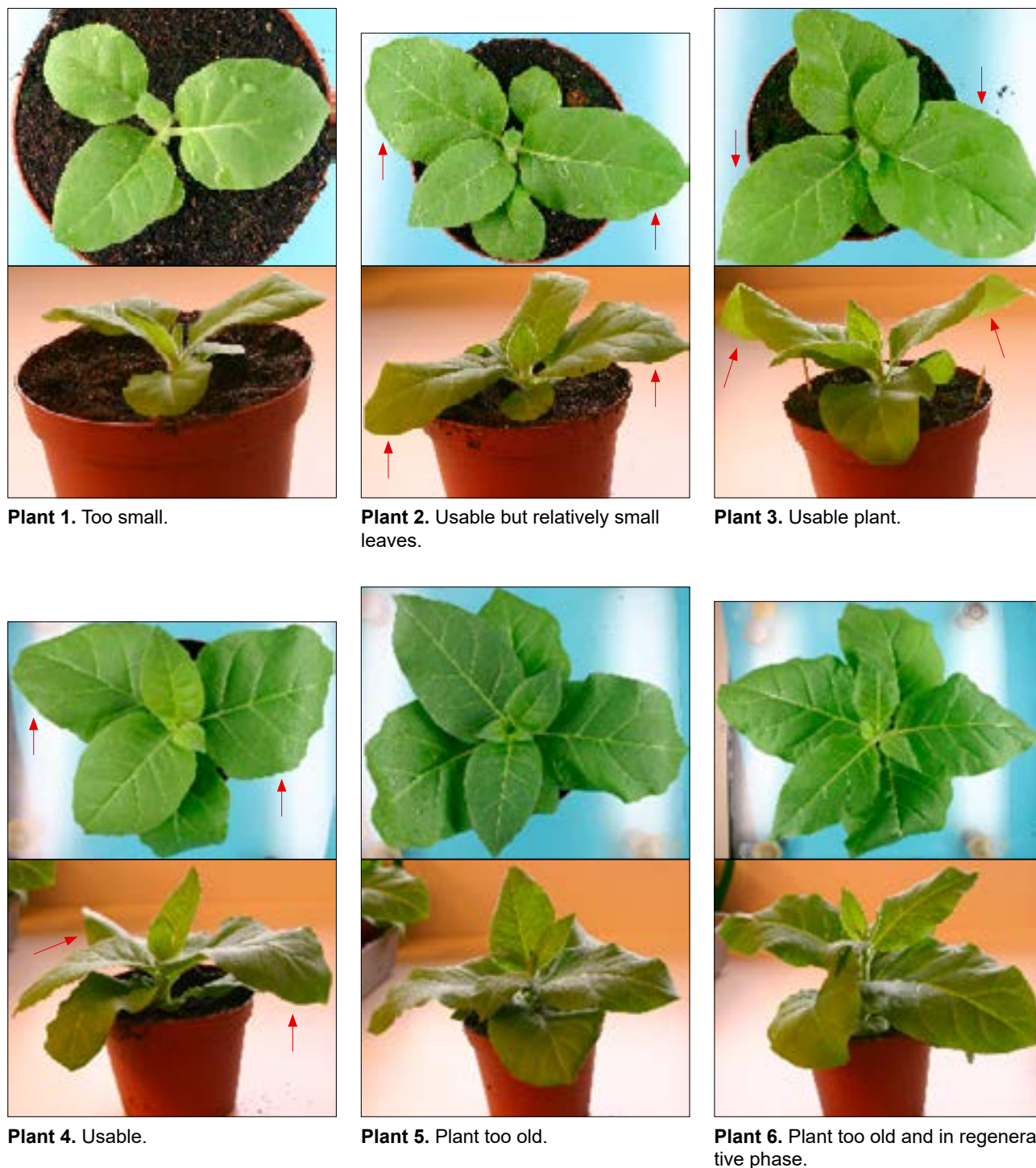
Figure 1. Overview of Nicotiana tabacum 'Xanthi NN' plants at different growth stages (CCP)(two pictures per plant; pot diameter: 14 cm).