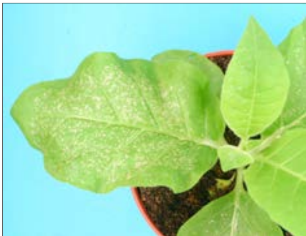
Figure 2. Local lesions on leaves of Nicotiana tabacum 'Xanthi NN' plant.