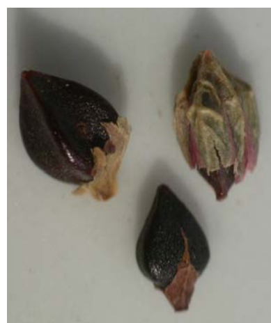
Seeds under magnification

Species of similar seeds of the genus (normal size seeds)