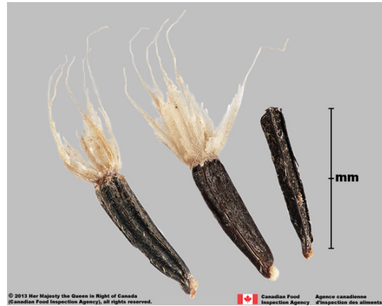
Ageratum houstonianum achenes with and without pappus scales

Authored by Susan Putz Canadian Food Inspection Agency, Canada