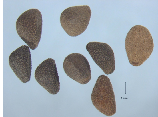
Seeds of Convolvulus arvensis

Embryo: with folded or crumpled cotyledons.