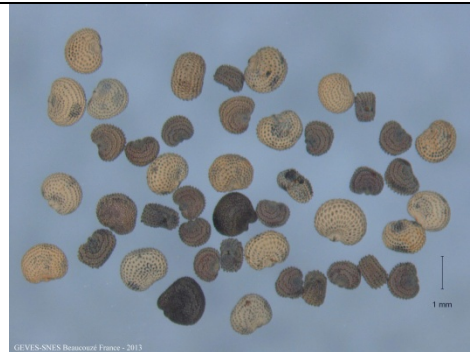
Seeds of Silene spp.