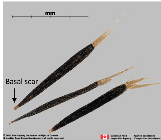
Tagetes minuta achenes with pappus scales

Authored by Susan Putz Canadian Food Inspection Agency, Canada