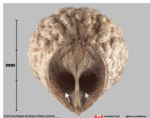
Inner side view of Bifora testisculata mericarp showing the hollowed face (arrows)