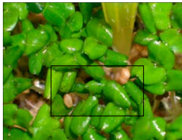
Figures 1, 2. Symptoms of Acidovorax valerianellae on corn salad cotyledons.