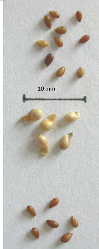
Normal size seeds of V. cornuta V. odorata V. tricolor

Note: The seeds of the different Viola species are very similar. There are some differences in size. Viola odorata has a bit different seeds with a cover of overlong fine film and very light colour.