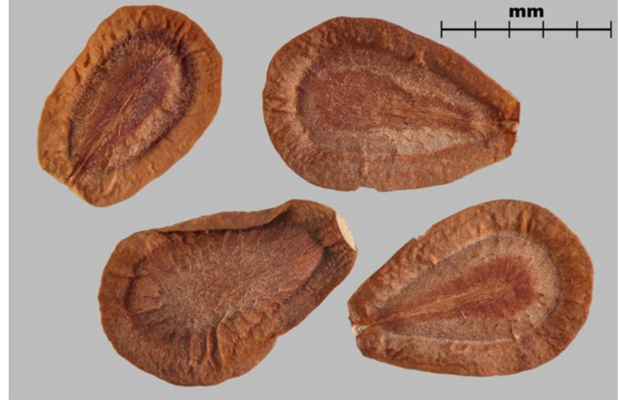
Common milkweed ( Asclepias syriaca ) seeds