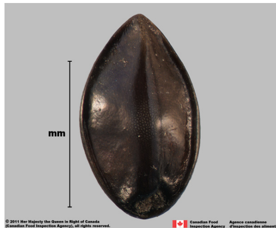
Inner side view of Myosotis arvensis nutlet

Authored by Susan Putz Canadian Food Inspection Agency, Canada