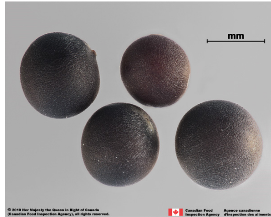
Sinapis arvensis seeds

Embryo: Folded embryo with minimal endosperm present.