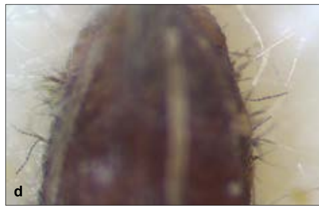
Figure 1. a Conidia of Alternaria dauci on simple or slightly branched conidiophores. b Conidia of A. dauci . c Conidia of A. dauci on simple or slightly branched conidiophores borne on a single rootlet initial. d Conidiophores and conidia of A. dauci and chains of the saprophyte Alternaria alternata on carrot seed.