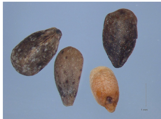
Seeds under magnification