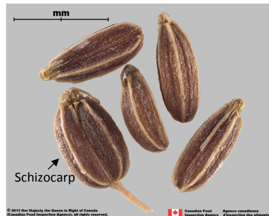
Ammi majus schizocarp and mericarps