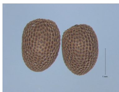
Seeds of Geranium dissectum