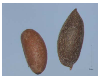
Seeds of Geranium pusillum