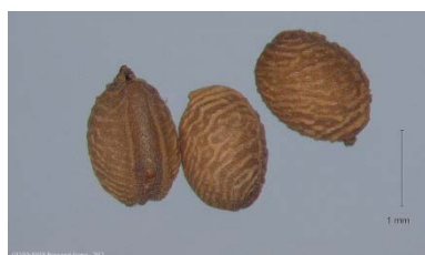
Seeds of Geranium molle