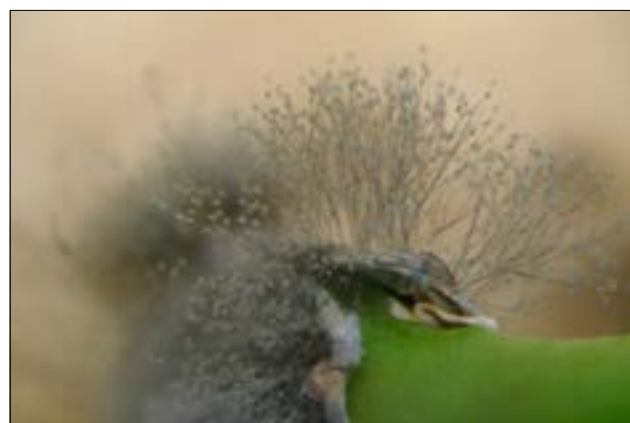
Figure 1. Soft rot of the root with abundant grey mycelium of Botrytis cinerea .