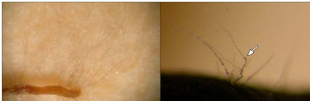
Figure 6. Non-sporulated mycelium of Botrytis cinerea with tape-like hyphae (arrow).