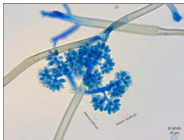
Figure 5. Conidiophores and conidia of Botrytis cinerea .