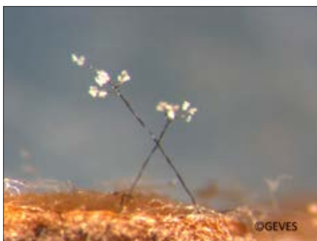
Figure 4. Isolated conidiophores of Botrytis cinerea .