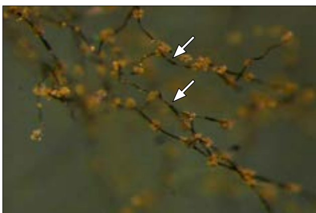
Figure 2. Sporulated mycelium with tape-like hyphae (arrows) of Botrytis cinerea .