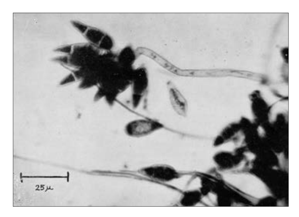
Figure 2. Conidia and conidiophores of P. oryzae . ×750.