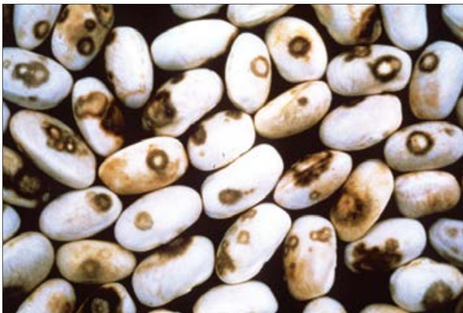
Figure 1. Dry, white bean seeds showing symptoms. Lesions on severely infected seeds may be either brown with whitish centres surrounded by a pale brown to dark brown area, or reddish lesions of variable size. Direct inspection is not considered as a dependable method, as not all infected seeds bear symptoms, and on dark-skinned varieties, symptoms are more difficult to see.