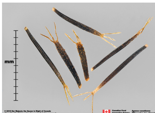
Bidens pilosa achenes with spines

Embryo: Embryo with well-developed cotyledons and a broad stalk having a truncate top, no endosperm.