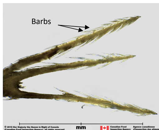
Close up of apical barbs on Bidens pilosa achene spines