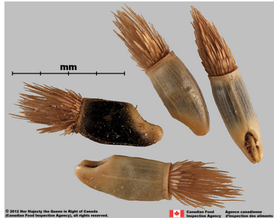
Centaurea cyanus achenes with pappus

Embryo: Embryo with well-developed cotyledons and a broad stalk having a truncate top, no endosperm.