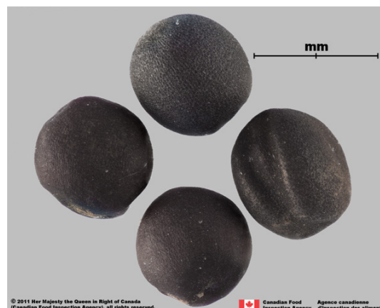
Brassica napus seeds

Embryo: Folded embryo with minimal endosperm present.