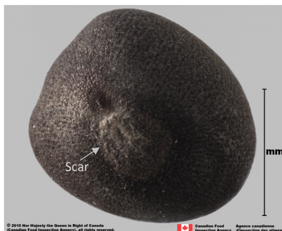
Brassica napus seed