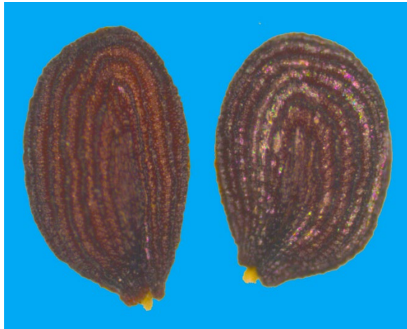
Thlaspi arvense (3)