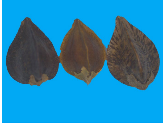
Fagopyrum esculentum (2)