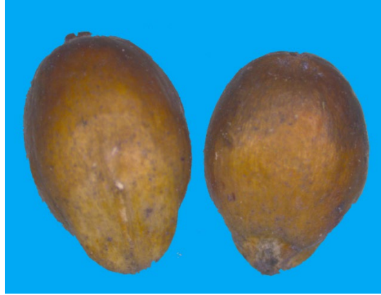
Sorghum bicolor subsp. bicolor (4)