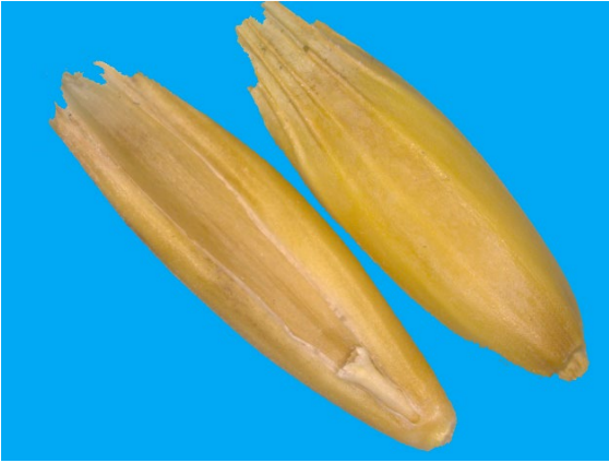
Avena sativa (3)