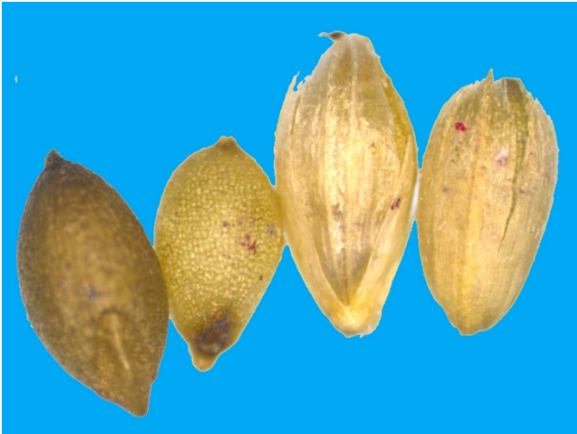
Phleum pratense (4)