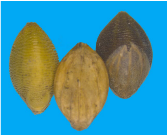
Setaria pumila (3)