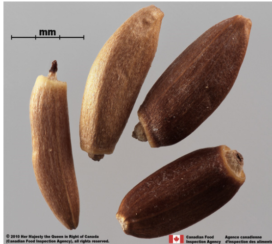
Cirsium arvense achenes

Embryo: Embryo with well-developed cotyledons and a broad stalk having a truncate top, no endosperm.