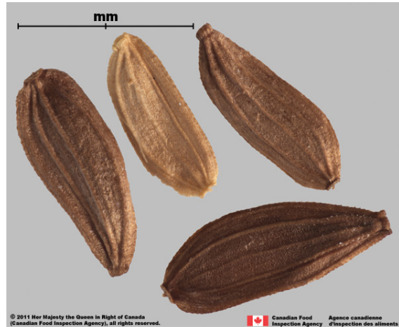
Sonchus asper achenes

Embryo: Embryo with well-developed cotyledons and a broad stalk having a truncate top, no endosperm.