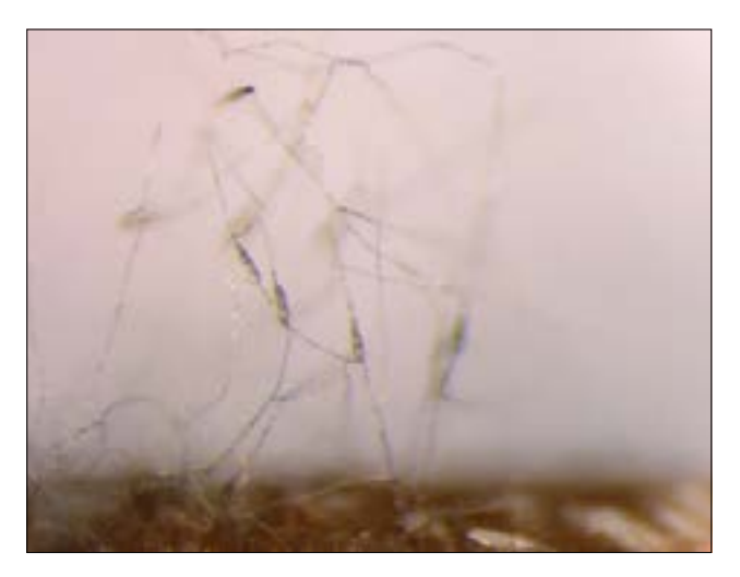
Figure 1. Conidia on rice seed.

Studied in international comparative testing: 1963, 1964