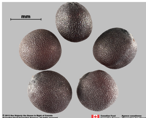
Brassica rapa seeds

Embryo: Folded embryo with minimal endosperm present.