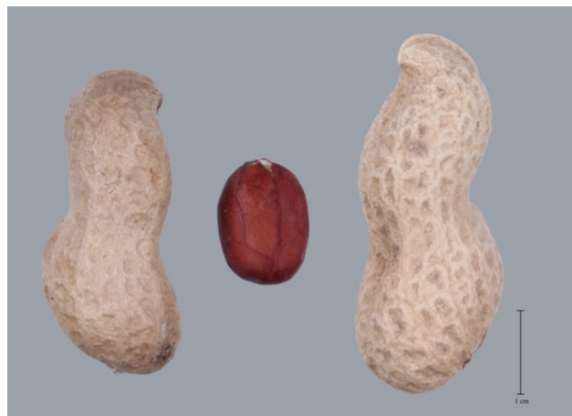
Pods and seed of Arachis hypogaea

Embryo: well differentiated at the base of the seed; cotyledons voluminous.