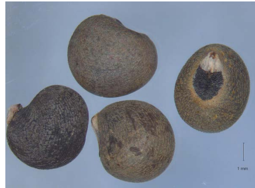
Seeds of Abelmoschus esculentus