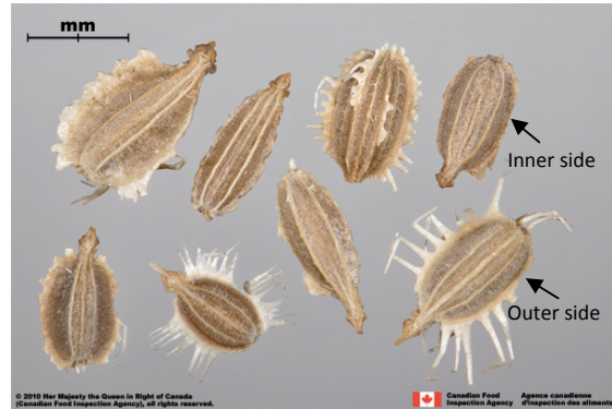
Inner and outer side views of Daucus carota mericarps

Embryo: Small, basal in fleshy, firm endosperm.