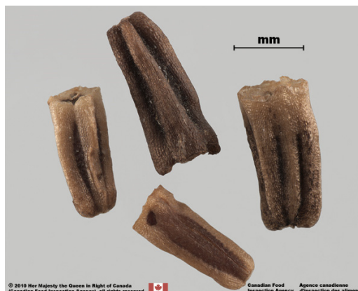
Tripleurospermum inodorum achenes

Embryo: Embryo with well-developed cotyledons and a broad stalk having a truncate top, no endosperm.